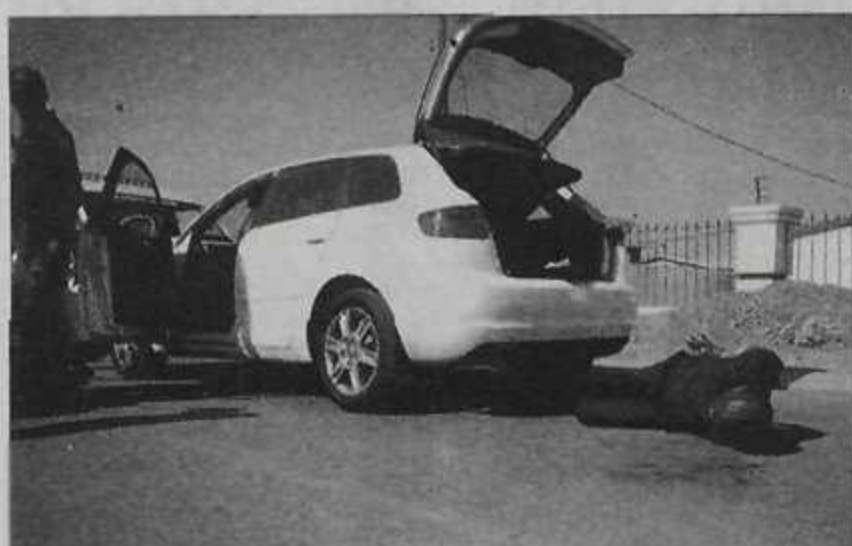
A suspect with the hijacked vehicle that police had traced to the cemetery via its tracking device.