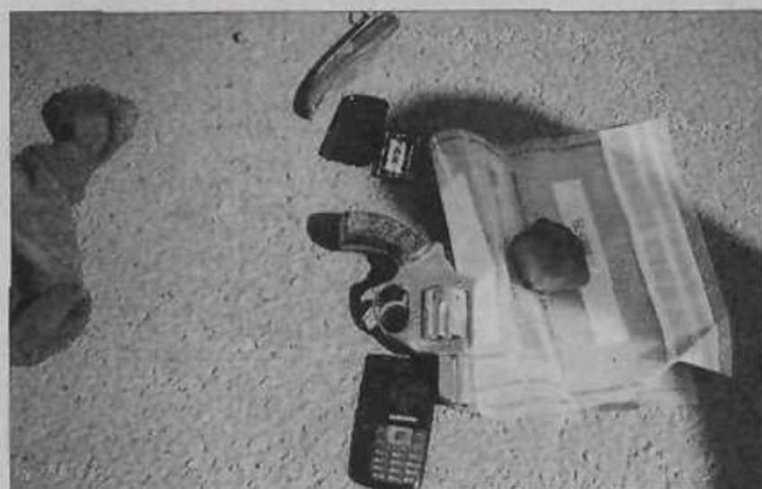
Evidence found by police when they arrested suspected hijackers who had attended the funeral of an accomplice at a cemetery.